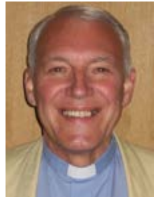
Chaplain to Woodford Green Athletics Club with Essex Ladies.